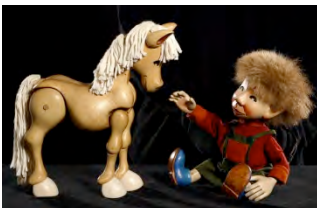
Figura Theater of Iceland’s Master Puppeteer performs Metamorphosis, a collection of hilarious and imaginative vignettes, featuring a cast of intricate, hand-carved marionette and unforgettable characters that are brought to life by hands, wooden spheres, and silk scarves. Metamorphosis dramatizes our constantly changing perceptions of the world and explores the “theatre” of daily life with poignant stories and gentle humour. This is a Spirit Festival performance